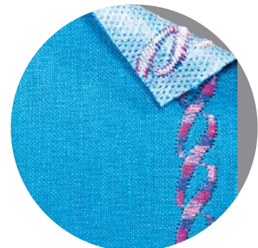
Embroidery with self-adhesive stabilizer