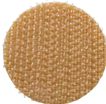
Adhesive-backed hook and loop tape